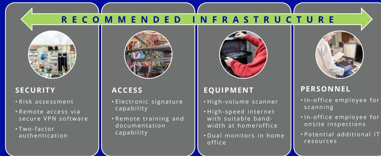
Figure 2. Recommended Infrastructure.

Comparing pros and cons of a remote working environment is a necessary step to determine best fit for any organization. Working from home allows for a great increase in flexibility for employees, but this should be weighed against productivity and security concerns.