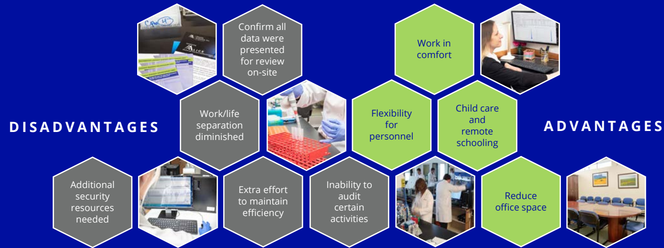
Figure 3. Advantages and Disadvantages of the Remote Work Environment.

A variety of materials may be reviewed remotely; e.g., electronic data and reports. Bench work, facilities and in-process study activities must be audited in person.