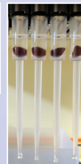
Figure 4. Dried blood spot punch extraction in tips of liquid handling instrument.