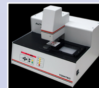
Figure 3. TOMTEC punching device used to punch DBS spots directly into tips of liquid handling instrument.